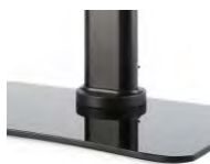
Tempered glass base